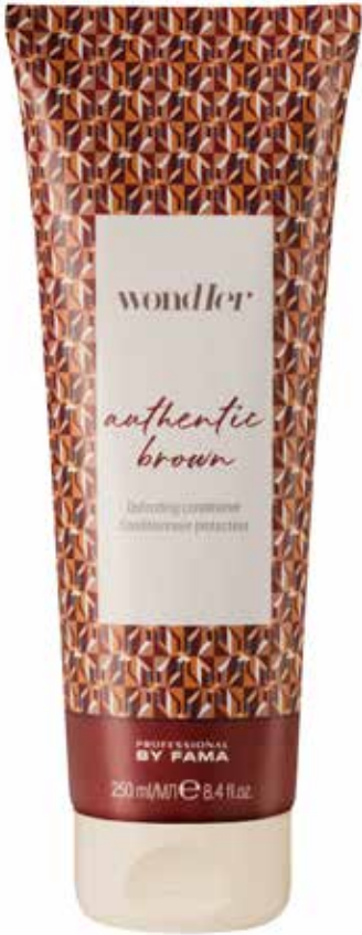
250 ml tube pH 4.5-5