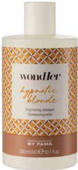
300 ml bottle pH 5.5-6