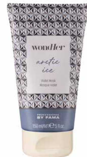
150 ml tube pH 4-4.5

Specific conditioner for bleached blonde, white and gray hair.