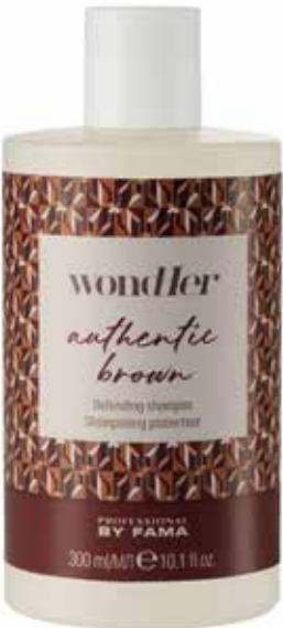
300 ml bottle pH 5.5-6