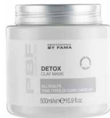
500 ml jar

Pink Clay cosmetic treatment with Alpha Hydroxy Acids from fruits.