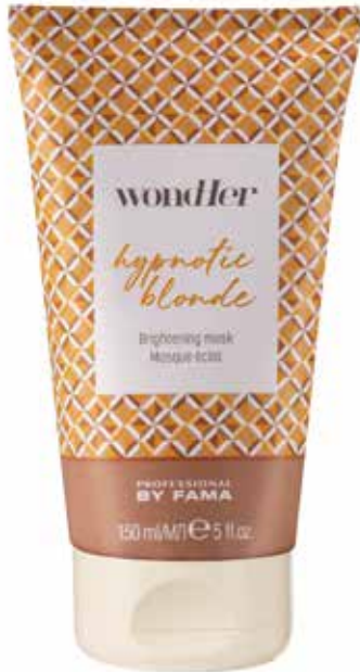
150 ml tube pH 4-4.5