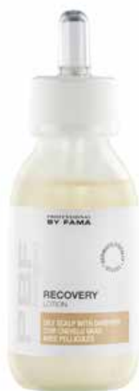
3 bottles of 95 ml each.

Lotion with Prebiotic and apple stem cells, specific for oily skin with dandruff.