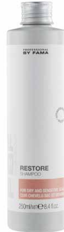
250 ml bottle

Shampoo with oat extract and prebiotic, specific for dry and sensitive skin.