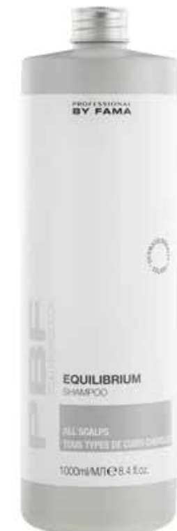
1000 ml bottle