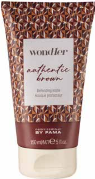
150 ml tube pH 4-4.5