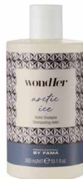
300 ml bottle pH 5.5-6

Specific shampoo for bleached blonde, white and gray hair.