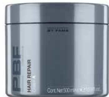
500 ml jar

Cream with Keratin and Amino Acids to be mixed with Hair Repair Lotion B for hair reconstruction treatment.