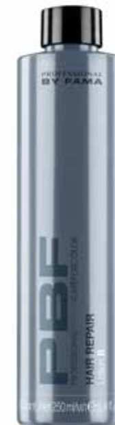
250 ml bottle

Lotion with moisturizing agents and Argan and Macadamia oils to be mixed with Hair Repair Cream A for hair reconstruction treatment.