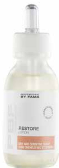
3 bottles of 95 ml each.

Lotion with Oat extract and Prebiotic, specific for dry and sensitive skin.