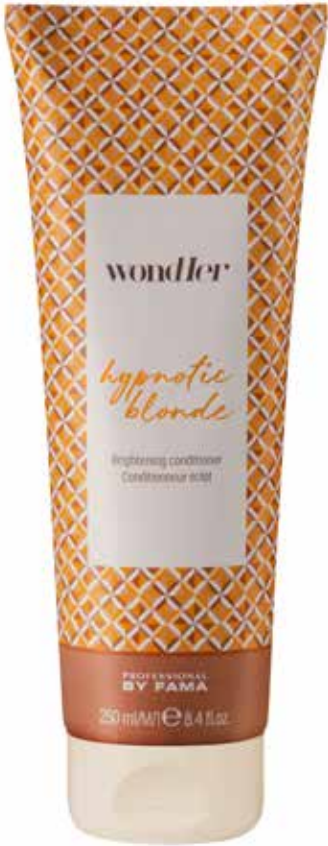
250 ml tube pH 4.5-5