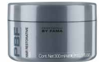
300 ml jar

Cosmetic elixir that, thanks to the acid pH <4, seals the reconstruction treatment in the salon and at home.