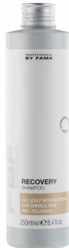
250 ml bottle

Shampoo with Prebiotic and apple stem cells, specific for oily scalp with dandruff.