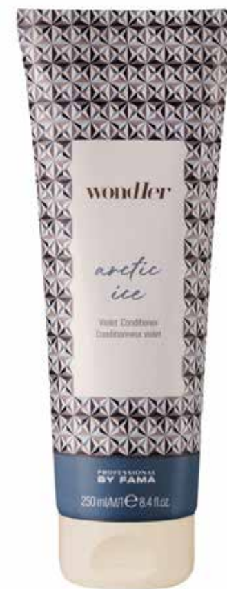
250 ml tube pH 4.5-5

Specific conditioner for bleached blonde, white and gray hair.