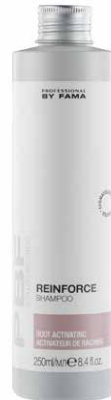
250 ml bottle

Shampoo with Energy Complex and Prebiotic for fragile hair that tends to thin.