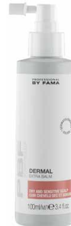
100 ml bottle

A concentrate of Camellia Japonica oil to rebalance the scalp skin.