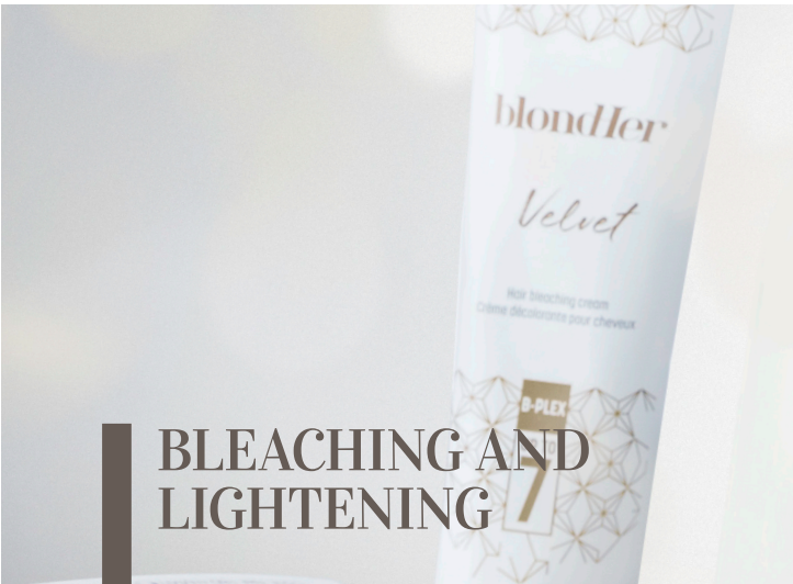
BLEACHING AND LIGHTENING