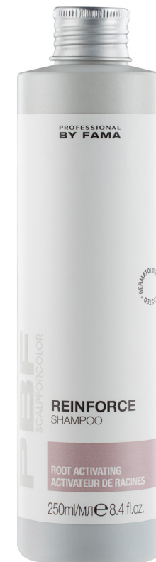
250 ml bottle

Shampoo with Energy Complex and Prebiotic for fragile hair that tends to thin.