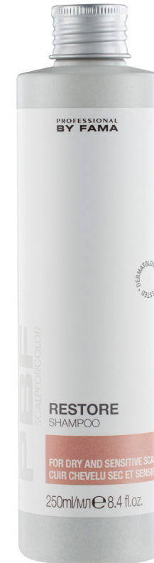
250 ml bottle

Shampoo with oat extract and prebiotic, specific for dry and sensitive skin.