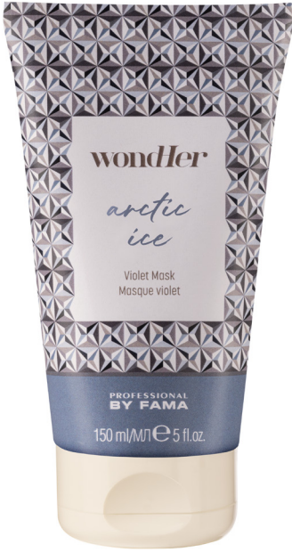
150 ml tube pH 4-4.5

Specific conditioner for bleached blonde, white and gray hair.