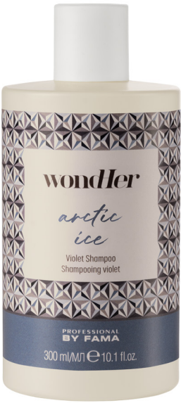
300 ml bottle pH 5.5-6

Specific shampoo for bleached blonde, white and gray hair.