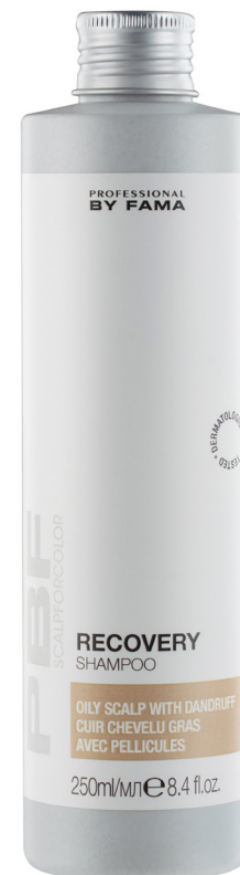
250 ml bottle

Shampoo with Prebiotic and apple stem cells, specific for oily scalp with dandruff.