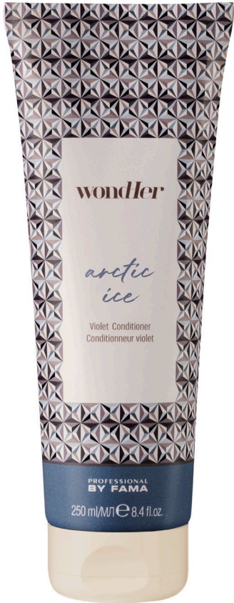
250 ml tube pH 4.5-5

Specific conditioner for bleached blonde, white and gray hair.